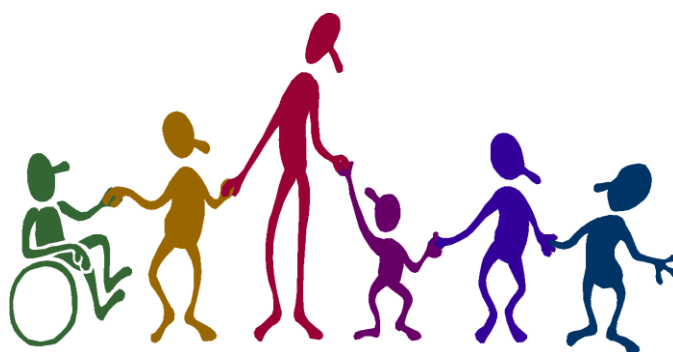
Figure 1; From http://legal-aware.org/

We believe everyone should have the same opportunities in life despite any differences or disabilities. Although some people may need more care and attention, it is only fair that everyone is given a fair chance.